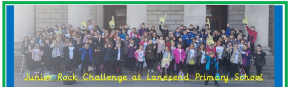
Junior Rock Challenge at Lanesend Primary School

If you have any School Money queries or need to have your password sent to you again, please do not hesitate to ask. Thank you.